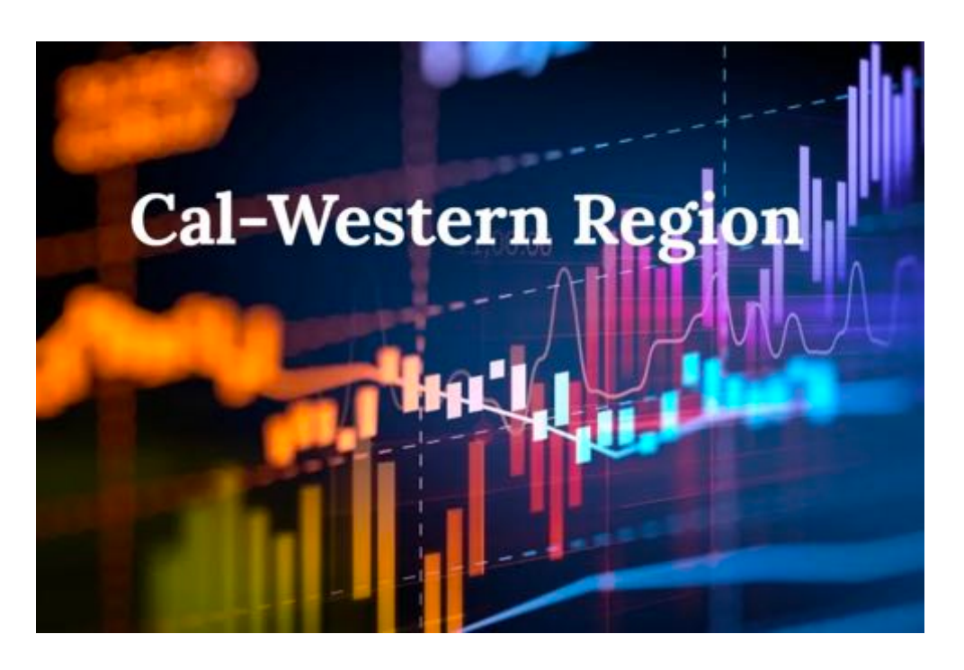
January 13-15, 2023 California State University Long Beach www.calwestnats.org